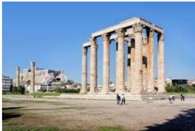
Olympian Zeus temple, Athens

A Doubles Consultation single elimination tournament. Matches will be played from Wednesday evening and during the whole period of the games according to the availability of players. (In extreme circumstances, the organization may ask a couple to be represented by a single player, if the other is engaged at some other event which falls behind schedule). Matchlength: 9-pts. Clocks will be set at 22 mins. per pair + 15 sec. delay time. Two prizes (70/30%)