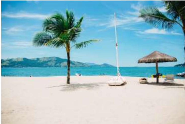
Go to the Seaside