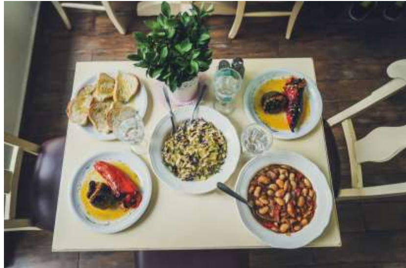
Try the local Delicacies