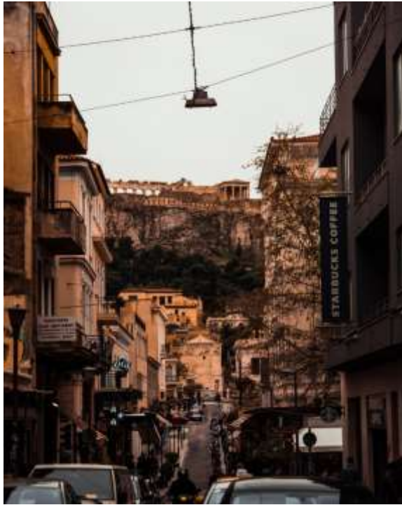
Walk through picturesque neighbourhoods