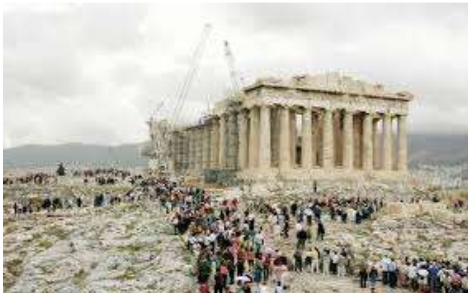
The Parthenon, Acropolis, Athens

Players who participate in both RandomGammon and FreeGammon , will be asked to evaluate their experience.