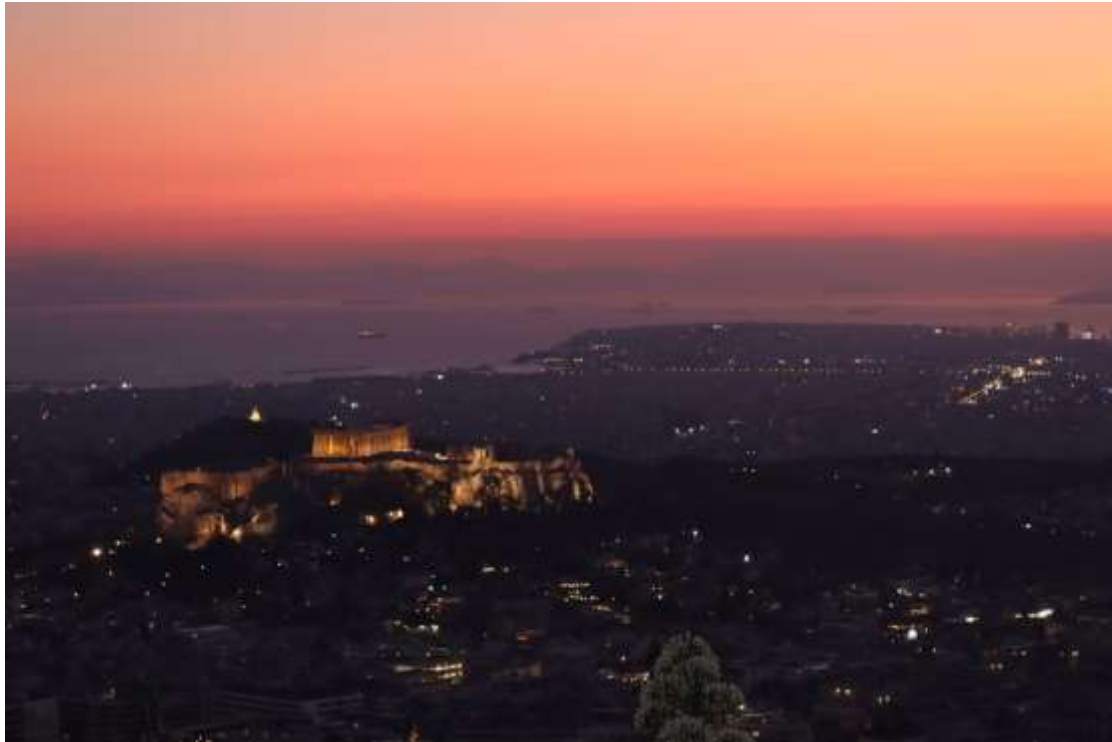
Discover the City by Night