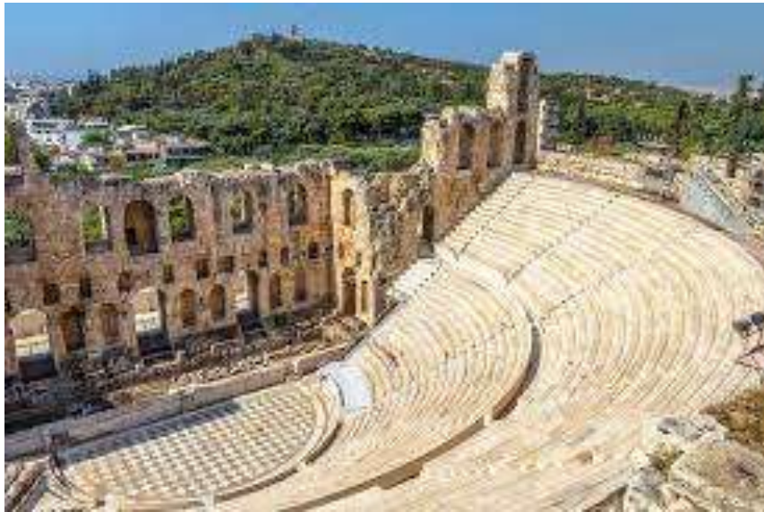
Herodium Theatre, Athens