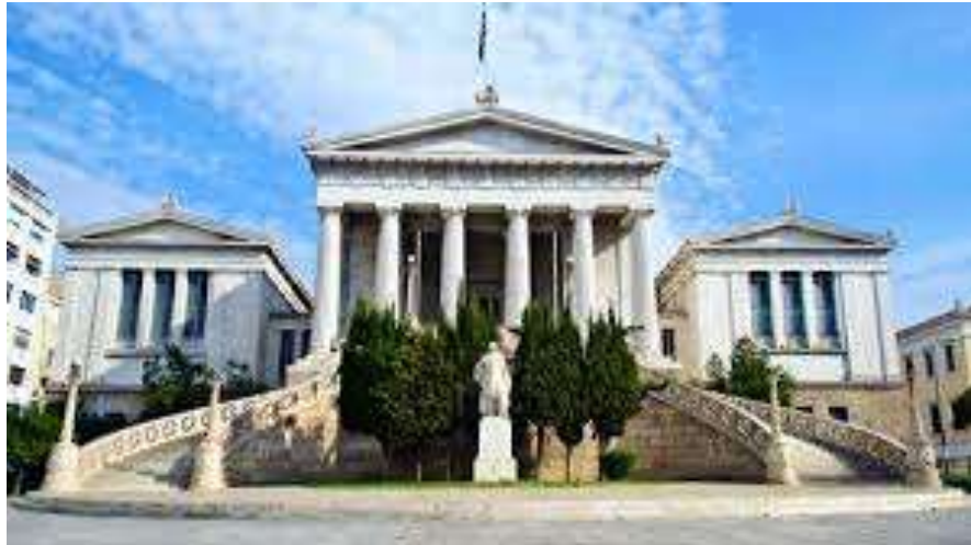
Vallianeio Megaron, Panepistimiou 32, Athens

The player who has collected the most points from Tuesday at 16:00 to Sunday at 17:00, wins the total pot – plus the title of the Amarilia Jackpots' Jackpot Winner, accompanied by a commemorative cup!