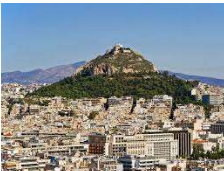
Lycabettus Hill, Athens