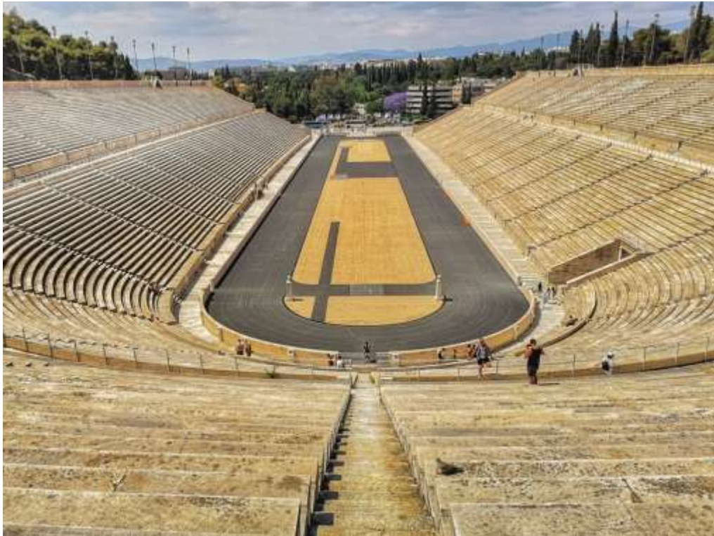
Panathinaikon Stadium, venue of the first modern era Olympic Games (1896)