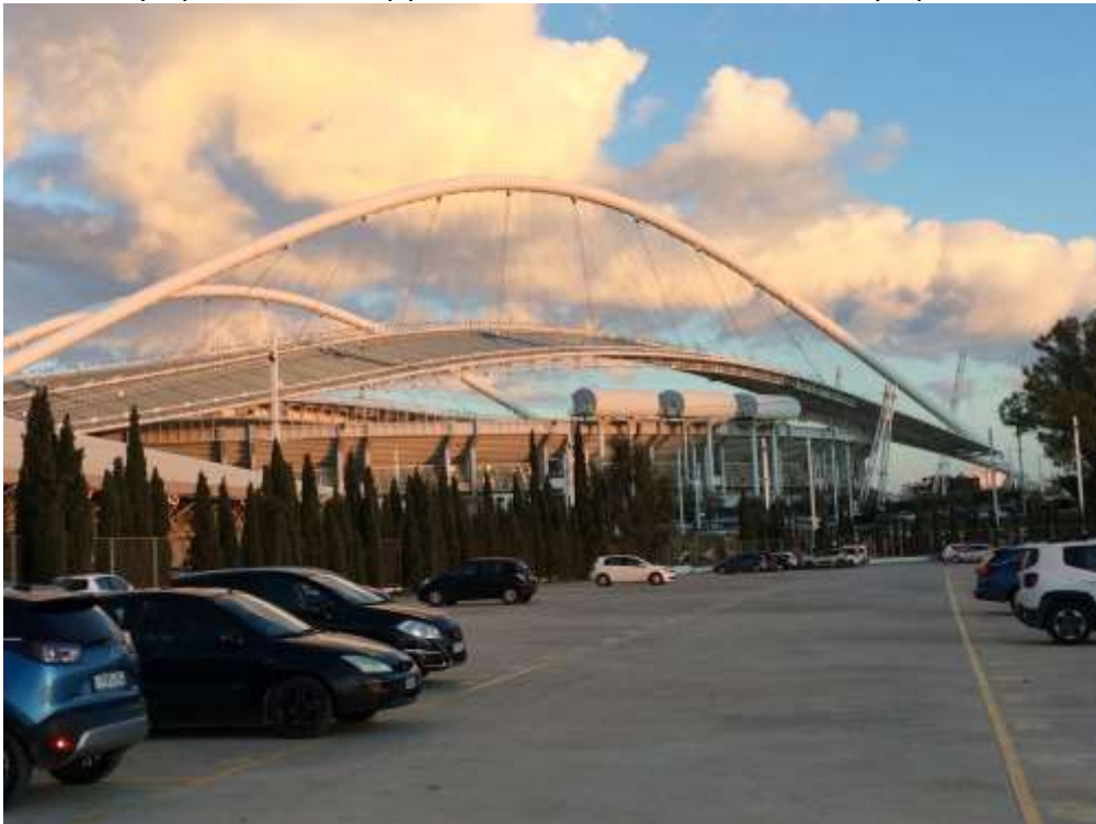
The Olympic Stadium “Spyros Louis”, home of the 2004 Olympic Games