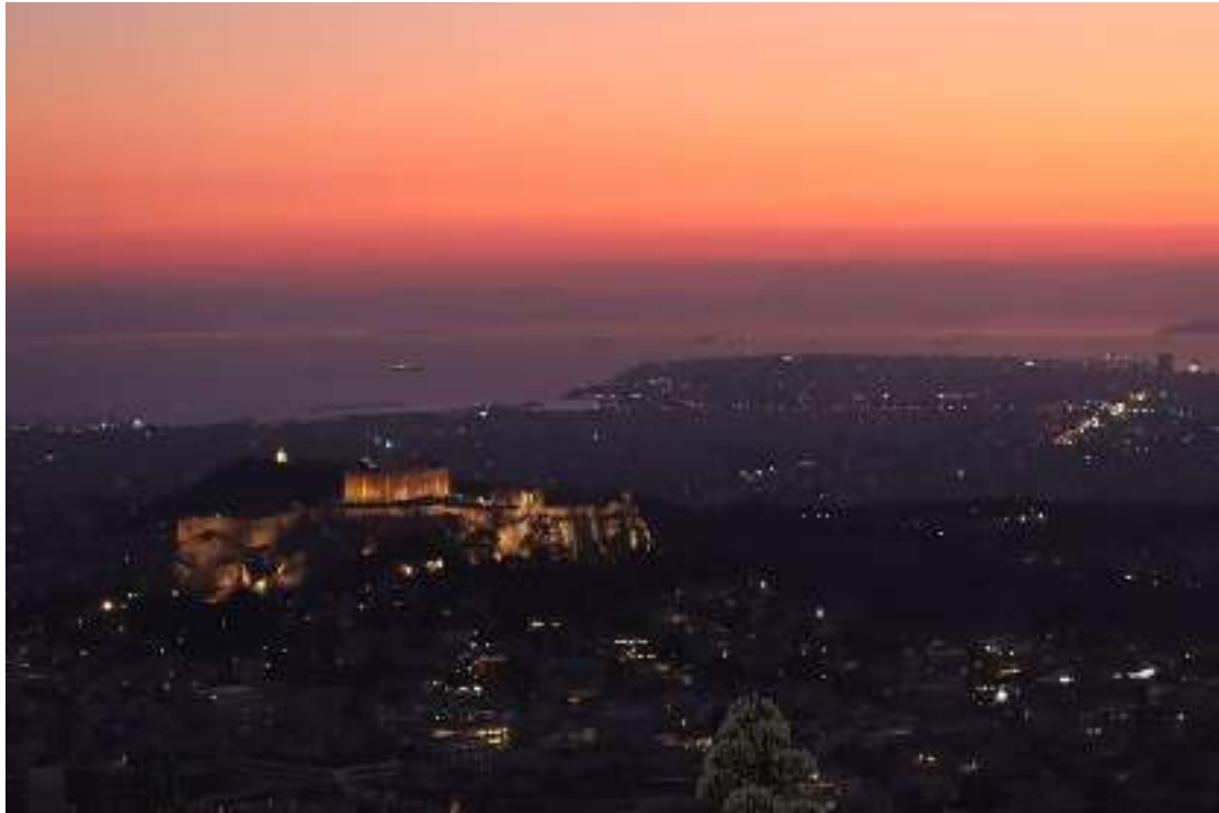
Discover the City by Night