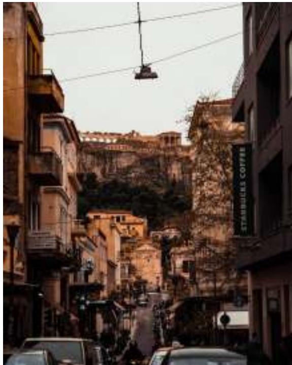
Walk through picturesque neighbourhoods