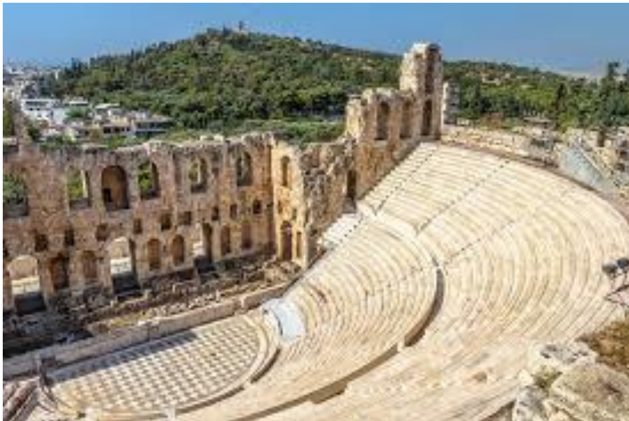
Herodium Theatre, Athens