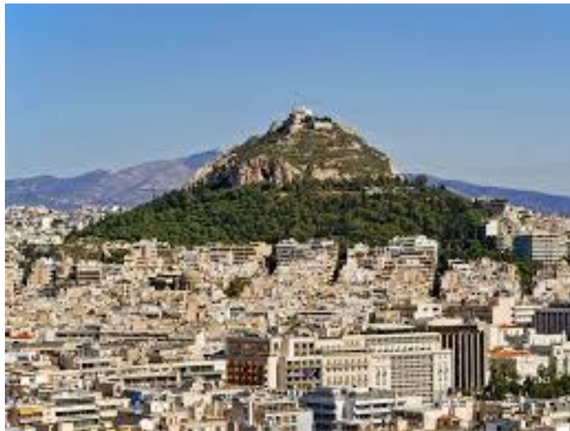
Lycabettus Hill, Athens