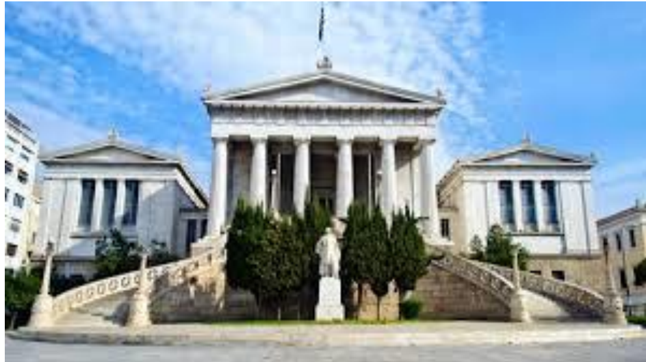
National Library, Athens

ca. 19:00 Prize giving Ceremony / Light Snack