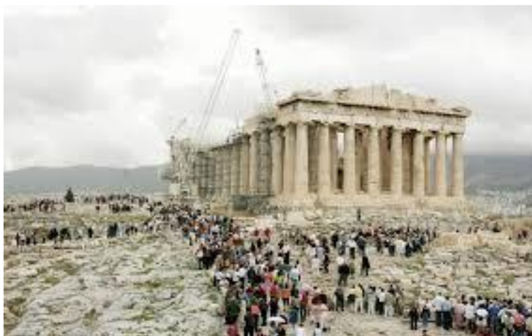
The Parthenon, Acropolis, Athens