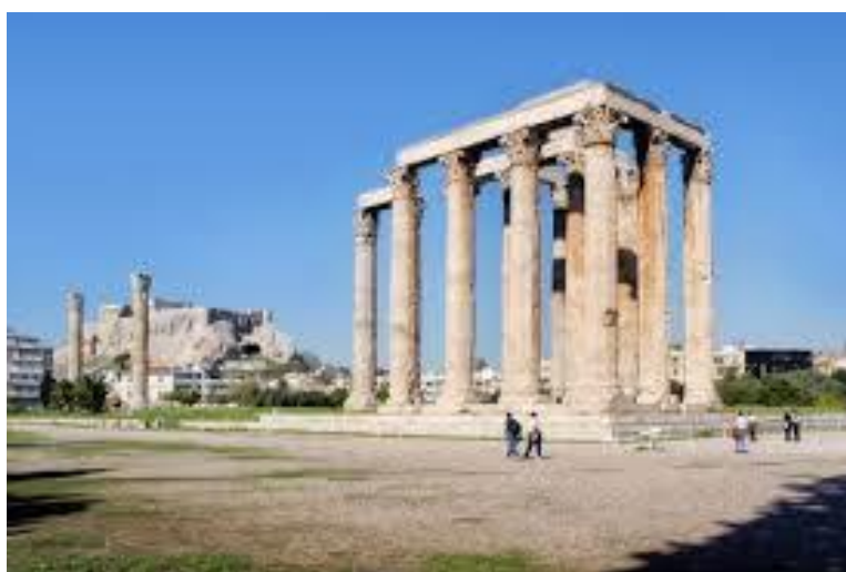
Olympian Zeus temple, Athens

Matchlength: 11-pts. for the Main, 7-pts. for the Fighters / Final: 13-pts. (& 9-pts. if a second final match is needed). Three prizes (50/30/20%)