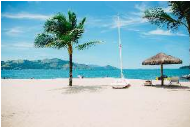
Go to the Seaside