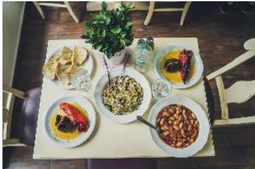
Try the local Delicacies