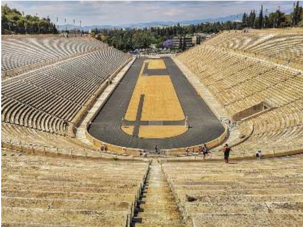
Panathinaikon Stadium, venue of the first modern era Olympic Games (1896)